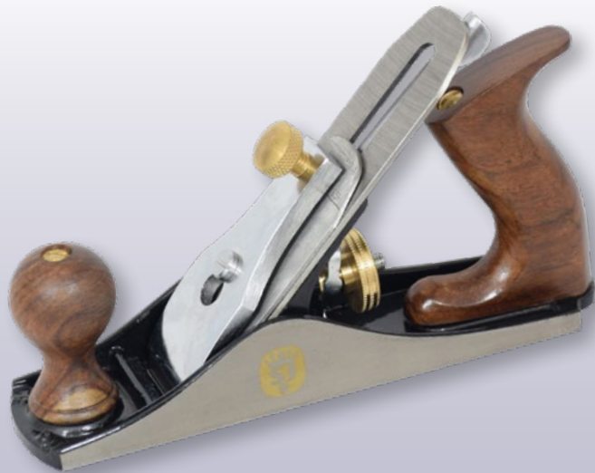
SJ-CSP3BLADE Replacement blade