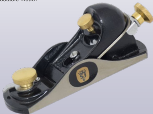
SJ-CBP65BLADE Replacement Blade