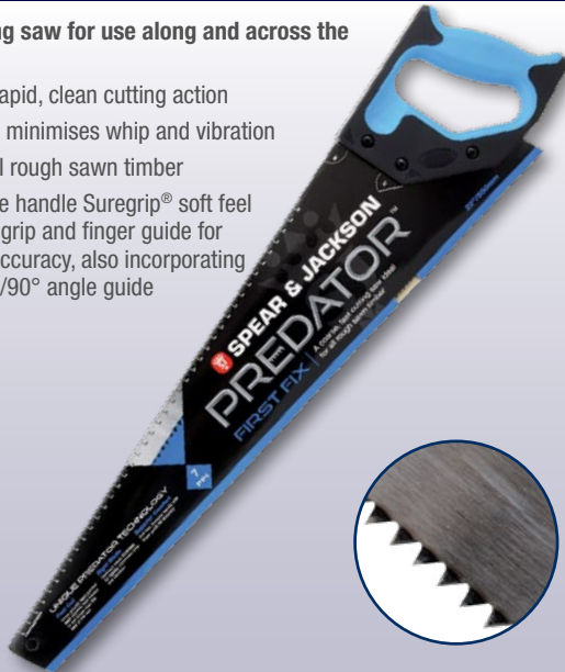
SJ-B98FF 550mm x 7pts, Rough Finish, 10 Pack