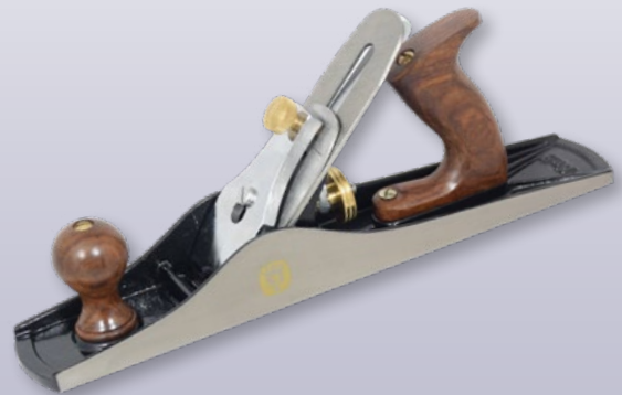
SJ-CJP5BLADE Replacement Blade