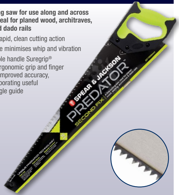
SJ-B982SF 500mm x 10pts, Medium Finish, 10 Pack