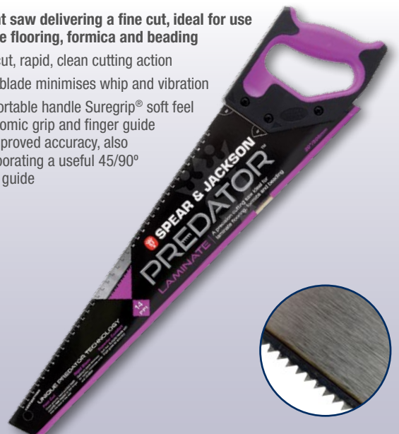
SJ-B98LAMINATE 500mm x 14pts, Extra Fine, 10 Pack