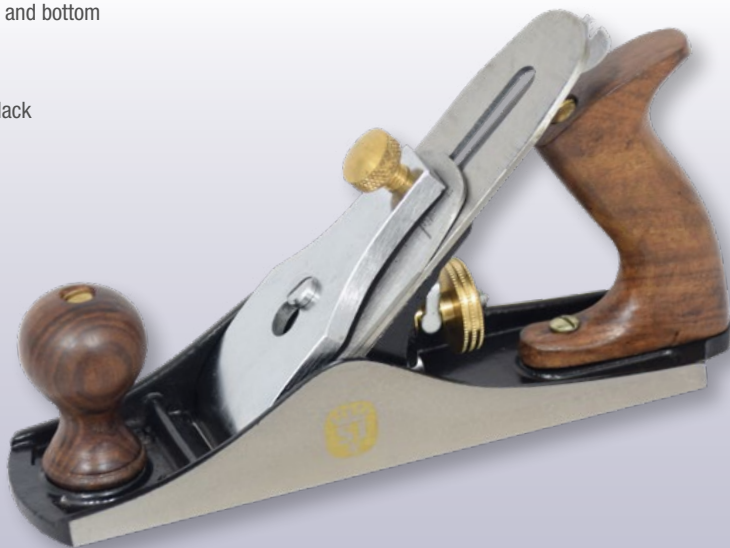
SJ-CSP4BLADE Replacement blade