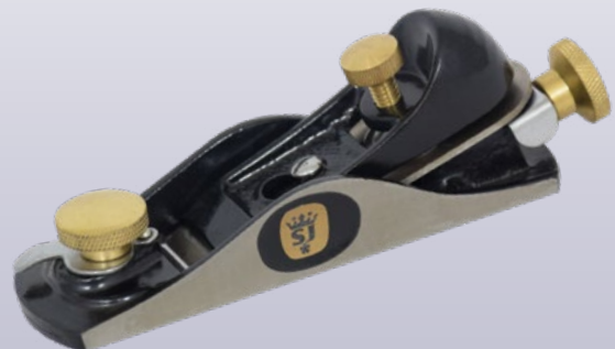
SJ-CBP95BLADE Replacement Blade