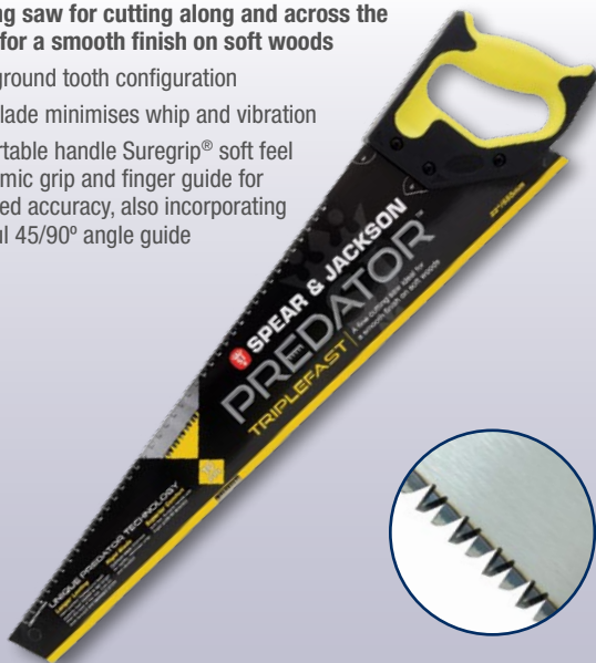
SJ-B98TRIPLE 550mm x 10pts, Medium Finish, 10 Pack