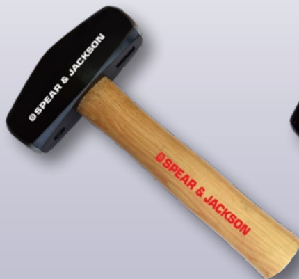
SJ-CH3W 1.3kg, Hickory, 4 Pack SJ-CH4W 1.8kg, Hickory, 4 Pack