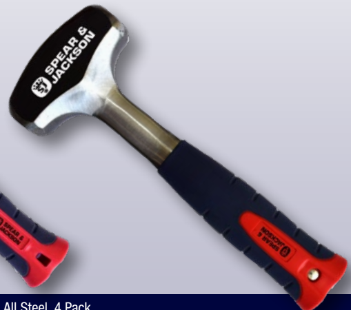
SJ-CH25AS 1.1kg, All Steel, 4 Pack SJ-CH4AS 1.8kg, All Steel, 4 Pack