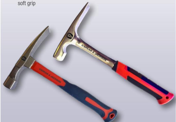
SJ-BRH24FG 680g, Fibreglass, 6 Pack