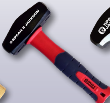
SJ-FGCH3 1.3kg, Fibreglass, 4 Pack SJ-FGCH4 1.3kg, Fibreglass, 4 Pack